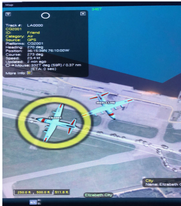
The MSSL's HC-130J Mock-Up as seen on the MINOTAUR Network as the 2001 lands.

The Mission System Sustainment Lab (MSSL) recently shot a beam of electromagnetic energy into space directly over HMF 2 at approximately 1,600 Megahertz. This successful transmission (and subsequent reply from an I-4 satellite) marked the completion of the HC-130J MINOTAUR Mock-Up. As a fully functioning replica of the airborne system, the mock-up will be an invaluable asset for the fleet. It's used for testing, troubleshooting and even training for both hardware and software on the most advanced mission systems flown by the USCG, Navy, and CBP. The completed MINOTAUR suite includes functionality with, but is not limited to the following systems: