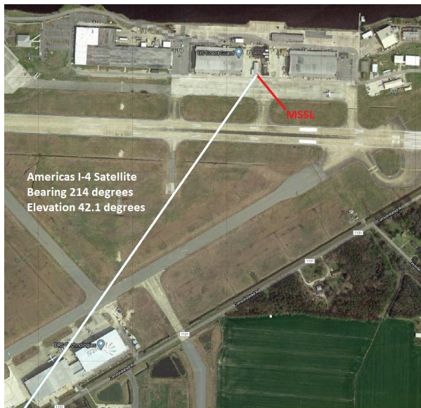
AET1 Abu-Zahra designed a custom installation for Bldg 80.